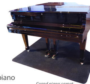
Grand piano carpet